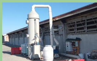
The air treatment plant