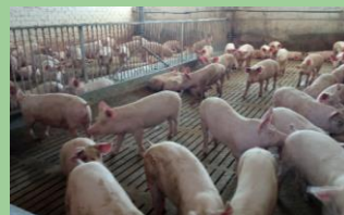
Pig livestock rooms