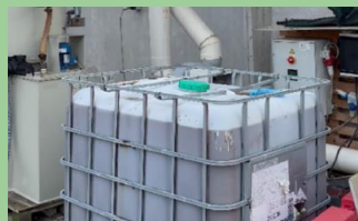
Ammonium sulphate fertiliser